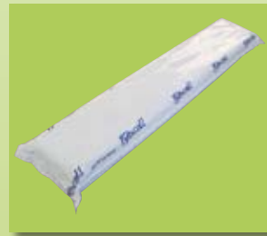
FytoSlab 900 x 180 x 80 mm