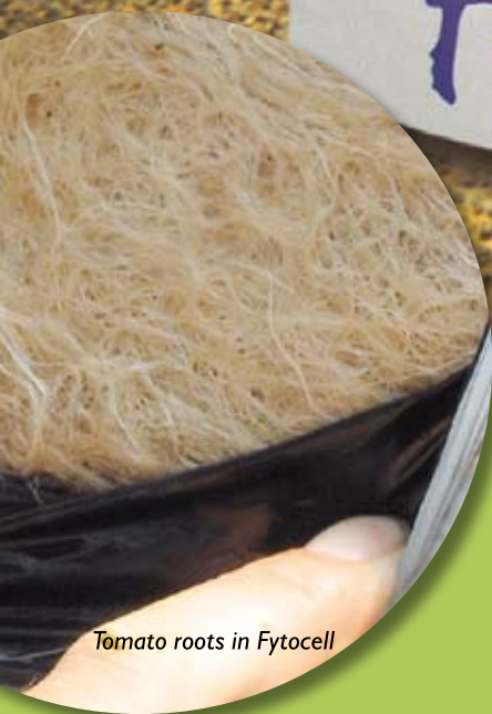
Tomato roots in Fytocell