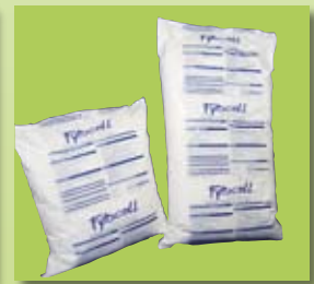
FytoFlake 50L and 100L plastic bags