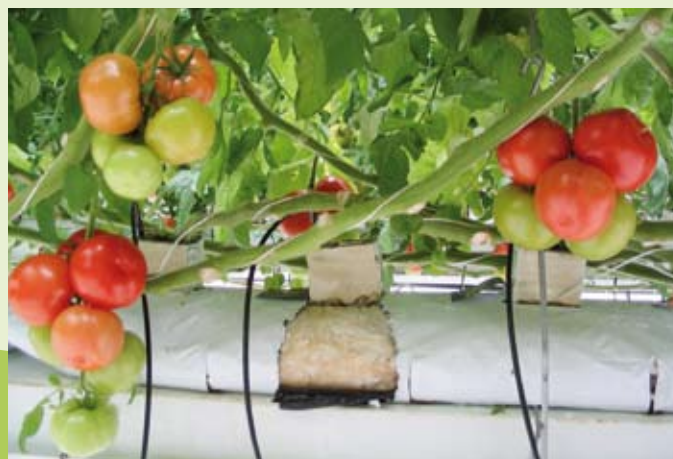
Very healthy, high yielding tomatoes growing in FytoFlake.