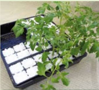
FytoClone 48 cell insert (4 x 12 cell) and perforated tray.

Get Rooted with FytoClone. Starting a plant has never been so easy. Just add water, light and warmth. FytoClone encourages large numbers of roots to grow. FytoClone is sterile and provides a well balanced environment with an excellent ratio of air to water. This results in pure white, quality roots. Hormone gel or powder is optional.