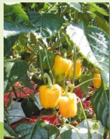
Healthy capsicums with a good fruit set growing in FytoFlake.