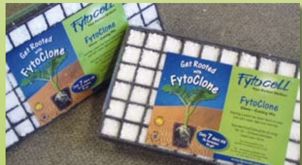
FytoClone 72 cell insert and perforated tray