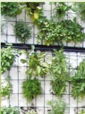
Herbs growing in a Fytoslab wall.

Grower feedback to date indicates both FytoFlake and FytoSlab provide a barrier to Scarid Fly invasion. Because FytoCELL is non fibrous Scarid Fly have difficulty penetrating the FytoCELL.